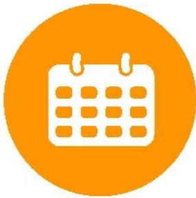
Buying and selling annual leave

We want to offer staff the most competitive benefits for working with us. We already benefit from our surroundings with six green flag recognised parks, extensive woodlands, excellent transport connections and a newly regenerated town centre, however all staff can make the most of the following: